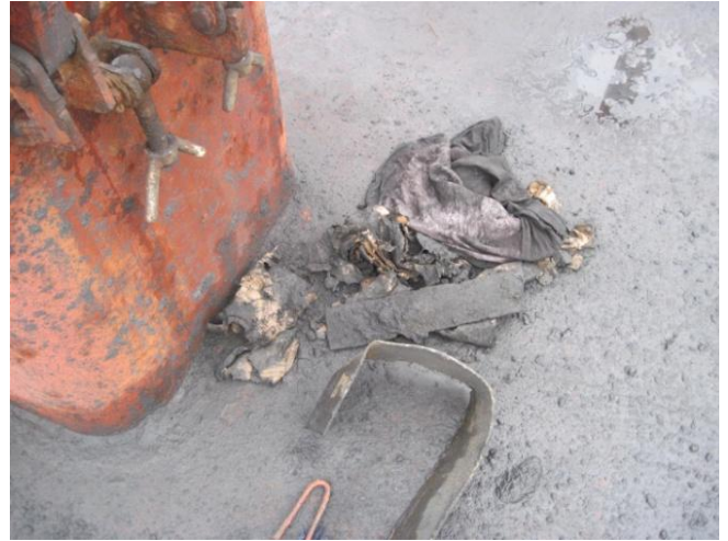
Photo No. 4 Foreign matters found at cargo iron ore concentrate.

In the usual circumstances if cargo is loaded on the pier at the port, our P&I surveyors recommend to arrange cargo cleaning by stevedores' brigade, to arrange cargo screening, install grates in order to separate the cargo from foreign matters, pieces of rags, plastic, lumps, etc. Such situation with cargo condition is quite common in Ukrainian ports especially if cargo stored at the ports'/terminals' open storage sites. All cleaning operations are carried out in the presence of our P&I surveyor who is monitoring and control the cleaning operations and check the cargo condition during loading constantly.