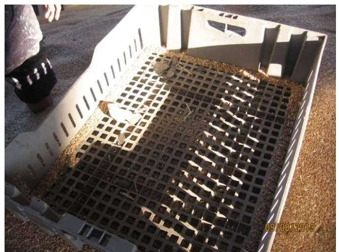
Photo No. 6 – Grain cargo screening by stevedores in order to separate cargo from foreign matters.