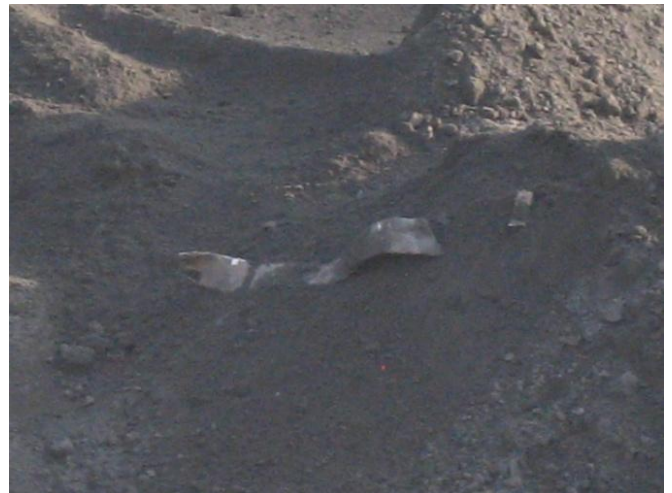
Photo No. 2 – Cargo iron ore concentrate contaminated by foreign matters at terminal's storage site.

Our surveyors while attending the vessels during loading at anchorage with grain cargoes, iron ore concentrate etc, pass their concerns due to cargo quality, in particular its physical condition because quite often cargo is partly contaminated by foreign matters, admixtures, pieces of rags, foam, timber, or even large pieces of plastic and rust, etc. The contaminants ranged from small parts, stones, rust, timber, debris, to entire plastic bottles, polyethylene bags or wire rope up to a half meter length seriously affecting cargo condition. It is clear that large pieces of foreign matters may cause a damage to discharge equipment, resulting a delay in cargo operations and subsequent claims and disputes.