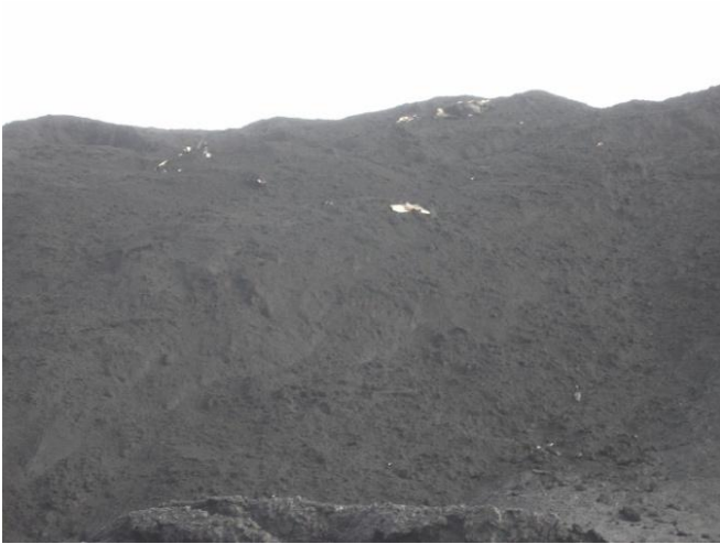
Photo No. 3 – Cargo iron ore concentrate stores at terminal's open area on a stockpile contaminated by foreign matters.